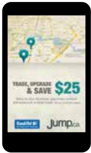
Full frame video

Captivate your target consumers with the combination of video, imagery and sound. Your 15-, 30-, 45-, or 60-second message is played in a loop. As well, 15-second video clips are interspersed between advertising to entertain consumers in between ads. From full frame videos and animations, to static images, the options for this product are endless. Contact your Account Executive for more information.