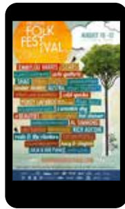
Static Image Example