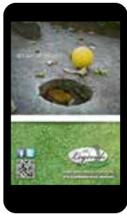
Video and Image Example